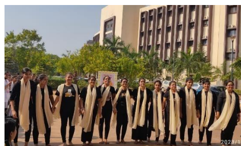
Students of CON presenting the Nukkad Natak