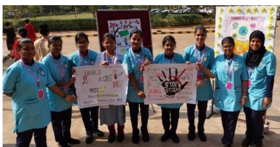
Students of CON displaying the posters